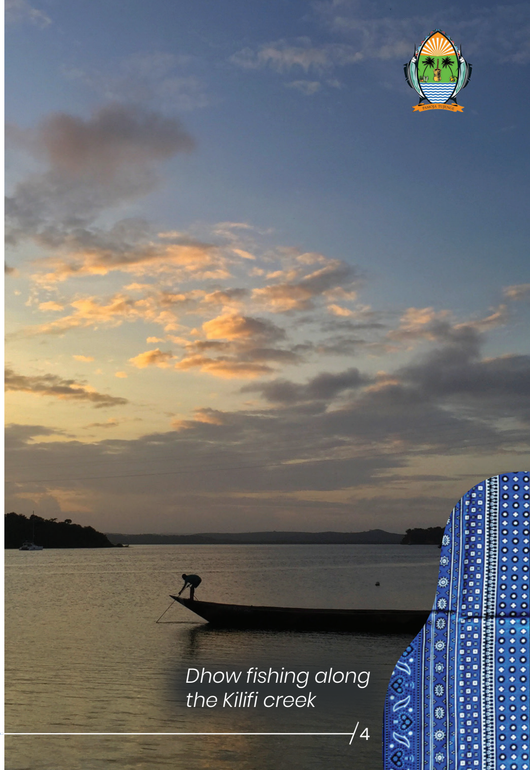
Dhow fishing along the Kilifi creek